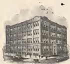
This entire plant devoted exclusively to the manufacture of Rite-Rite mechanical pencils and leads.